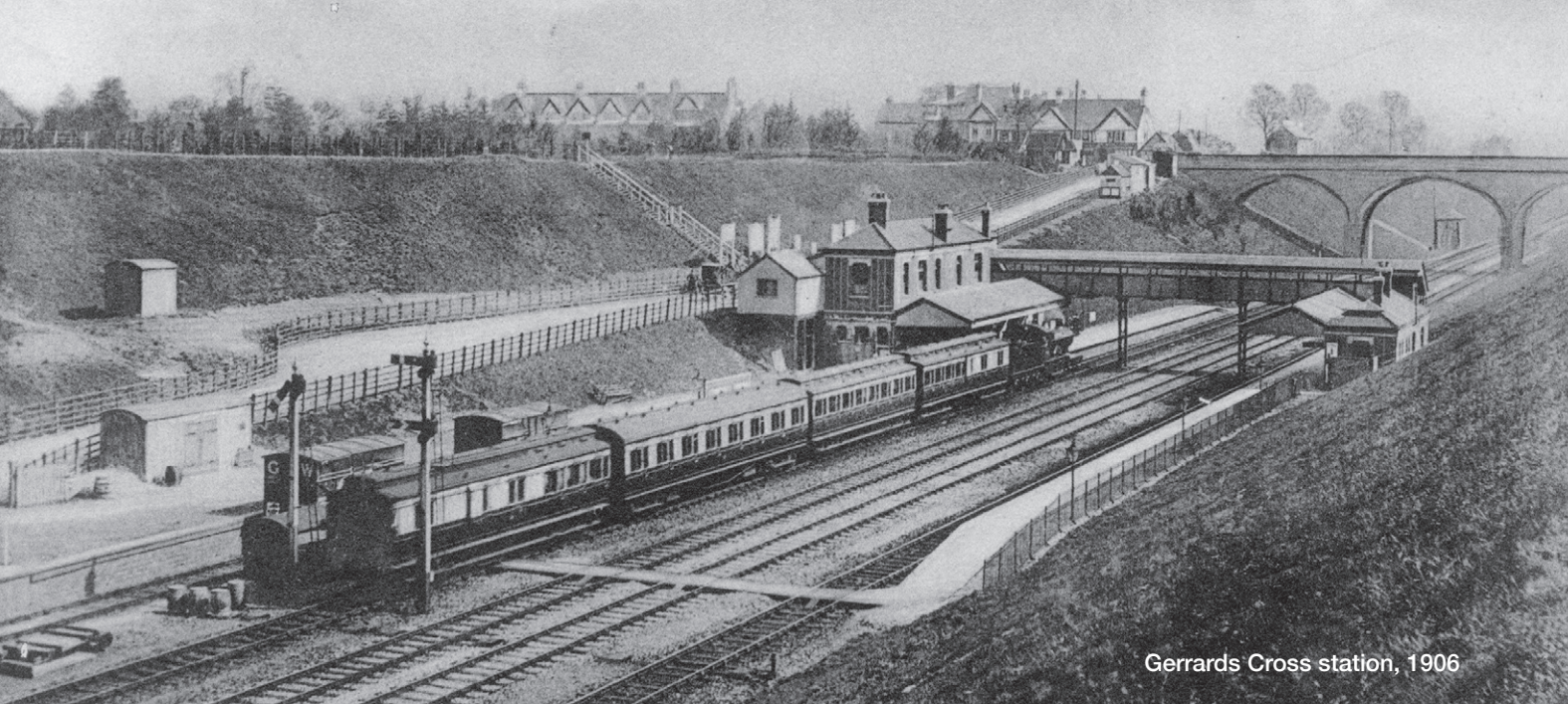
Gerrards Cross station, 1906